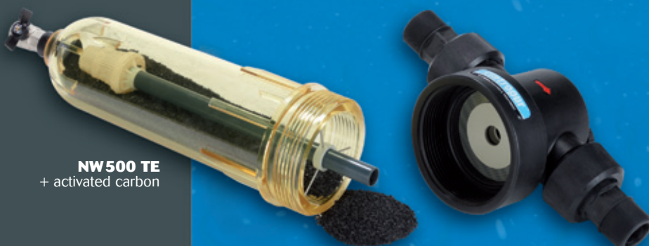
NW 500 TE + activated carbon

The activated carbon CINTROPUR is sold separately and is highly suitable for the improvement of taste and the removal of odour, chlorine, ozone, micropollutants such as pesticides and other dissolved organic substances.